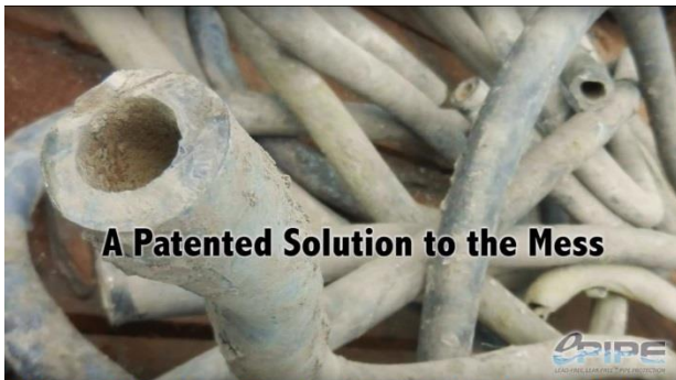
A Patented Solution to the Mess

Video - Lining Lead Service Lines in the US - Click Here